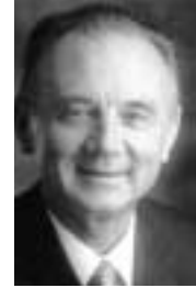
Chairman, LSF Board of Directors

During the past 18 months, the LSF-Southwest Region has experienced tremendous change and growth. We increased both revenues and staff by 52%, and we