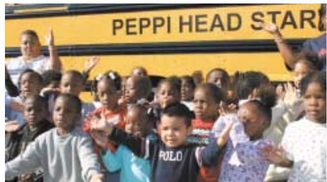
(l to r) The PEPPI children celebrate the gift of their new school bus.